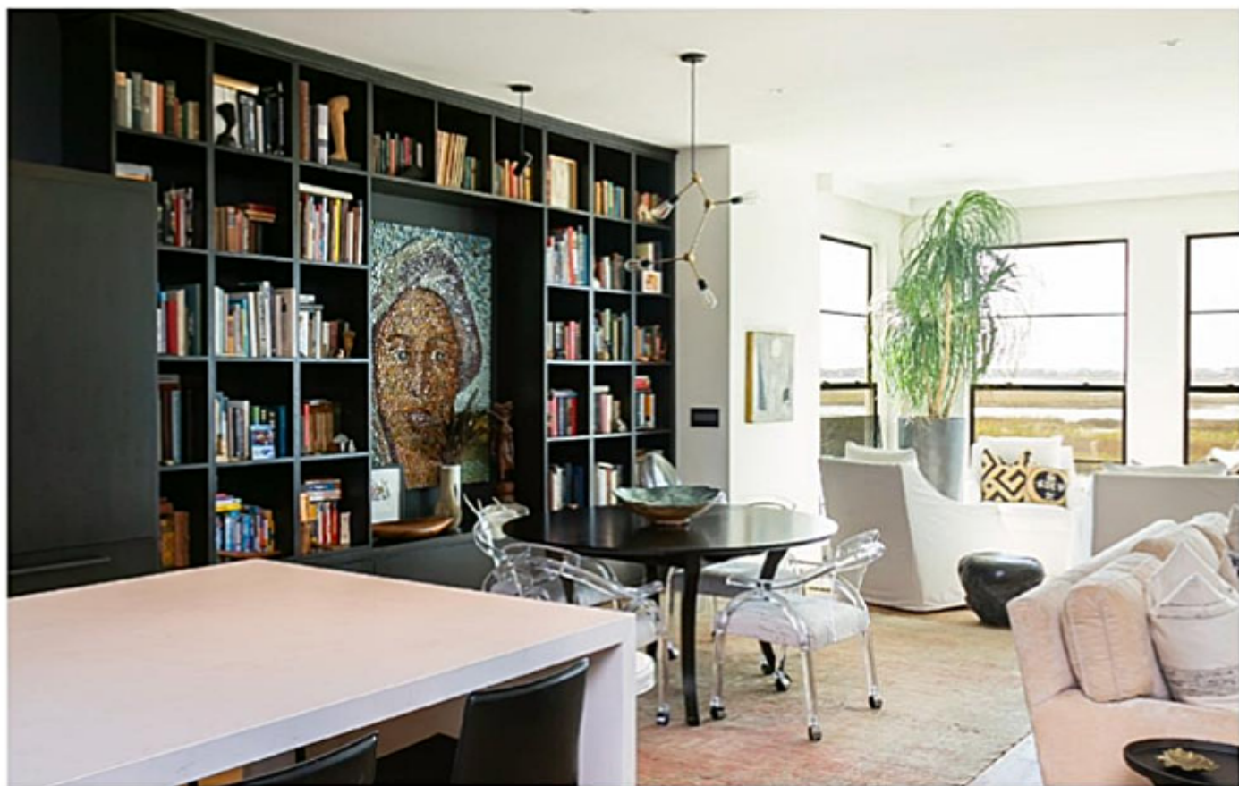
Story by Susan Fitzgerald Burridge • Photography by Ebony Ellis