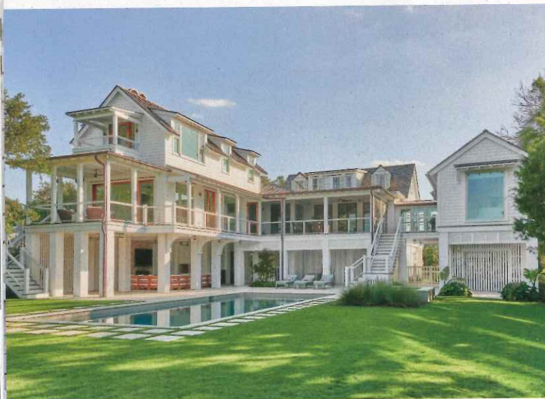
The side bedroom wing (above) was originally a separate cottage and is now attached via a glass “hyphen.” The rear addition includes an open great room on the main floor, and a master suite on the second floor. Top: The stairway was updated with new newel posts and square pickets.

into a small bedroom. “We kept it raw,” Clowney says, referring to the original interior walls, some of which retain the colorful patina of weathered layers of paint added over the years.